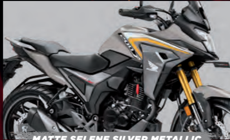
MATTE SELENE SILVER METALLIC